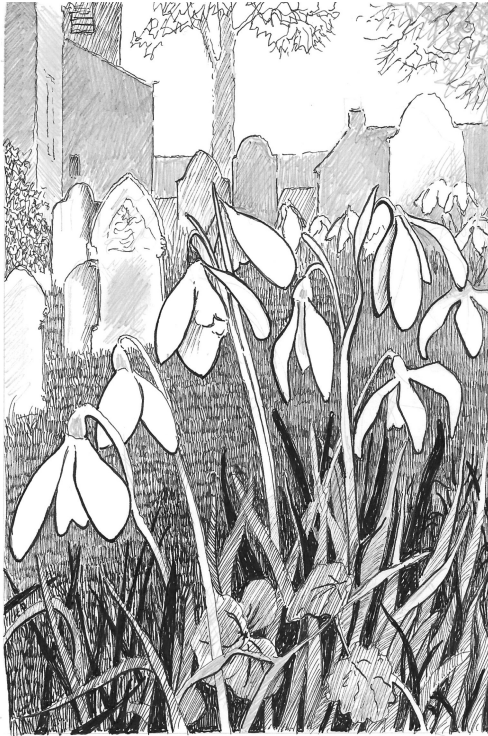
Snowdrops Kirkby Churchyard